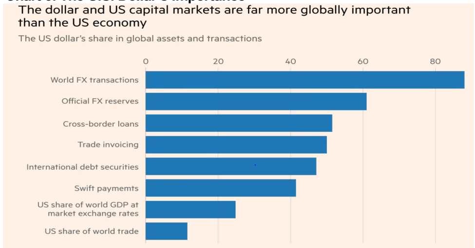
Chart 3. The U.S. Dollar’s Importance